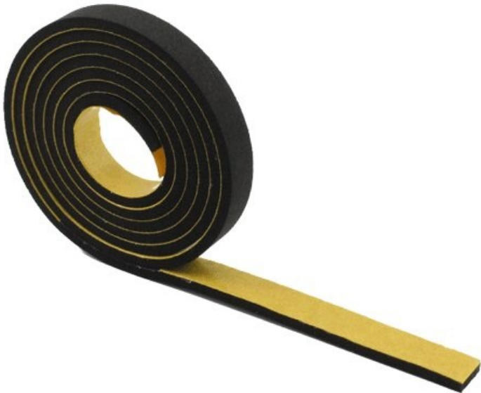
Sealing tape 10×3×1000